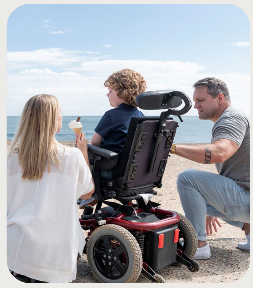
Images are for representative purposes only and do not depict an actual patient. Social worker program may vary by state.